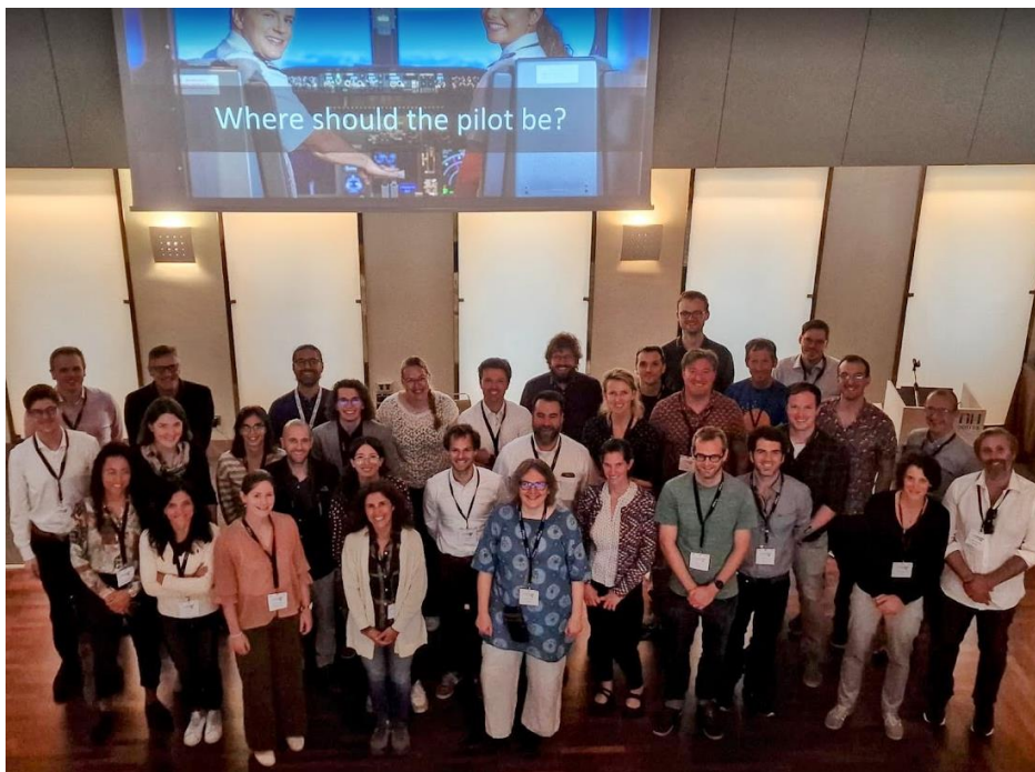
Figure 2 - Participants and organizers.

These groups have been meeting since the end of the workshop and we all look forward to their upcoming contributions to the community!